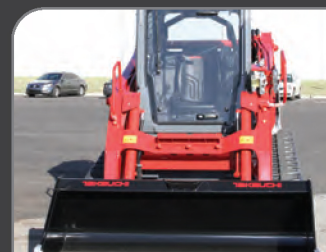
Lower Cross Member & Step