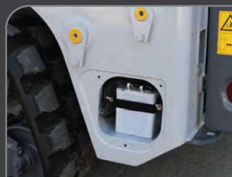
Battery Access Panel