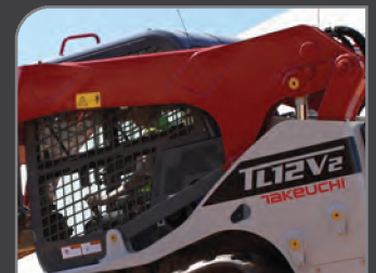
Oversized Lift Cylinders