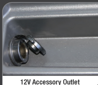
12V Accessory Outlet