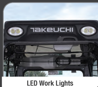
LED Work Lights