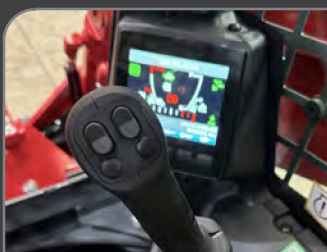
Pilot Operated Controls